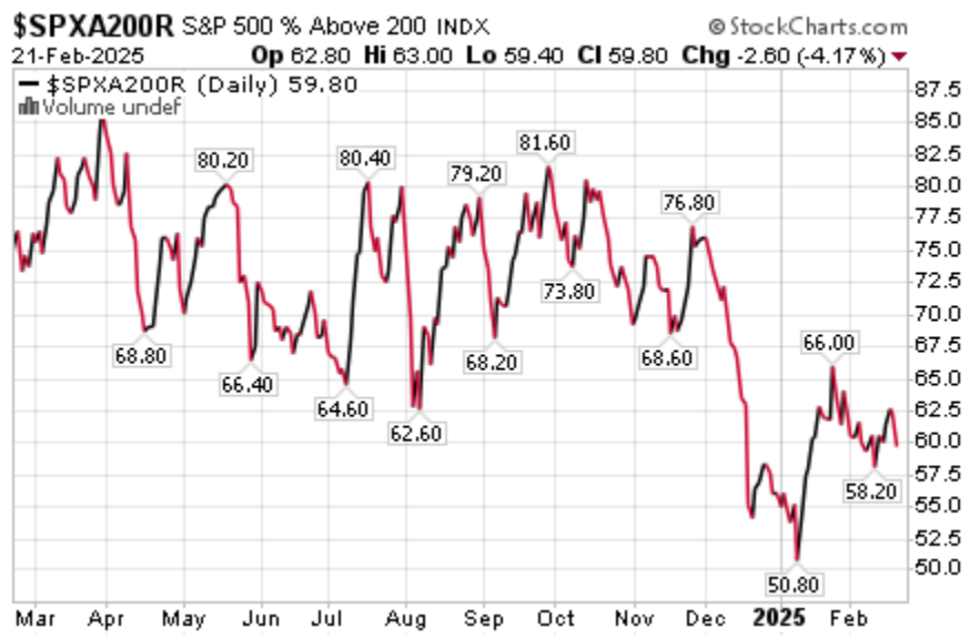
The long term Barometer dropped 2.60 on Friday and fell 0.20 last week to 59.80. It returned to Neutral on Friday.